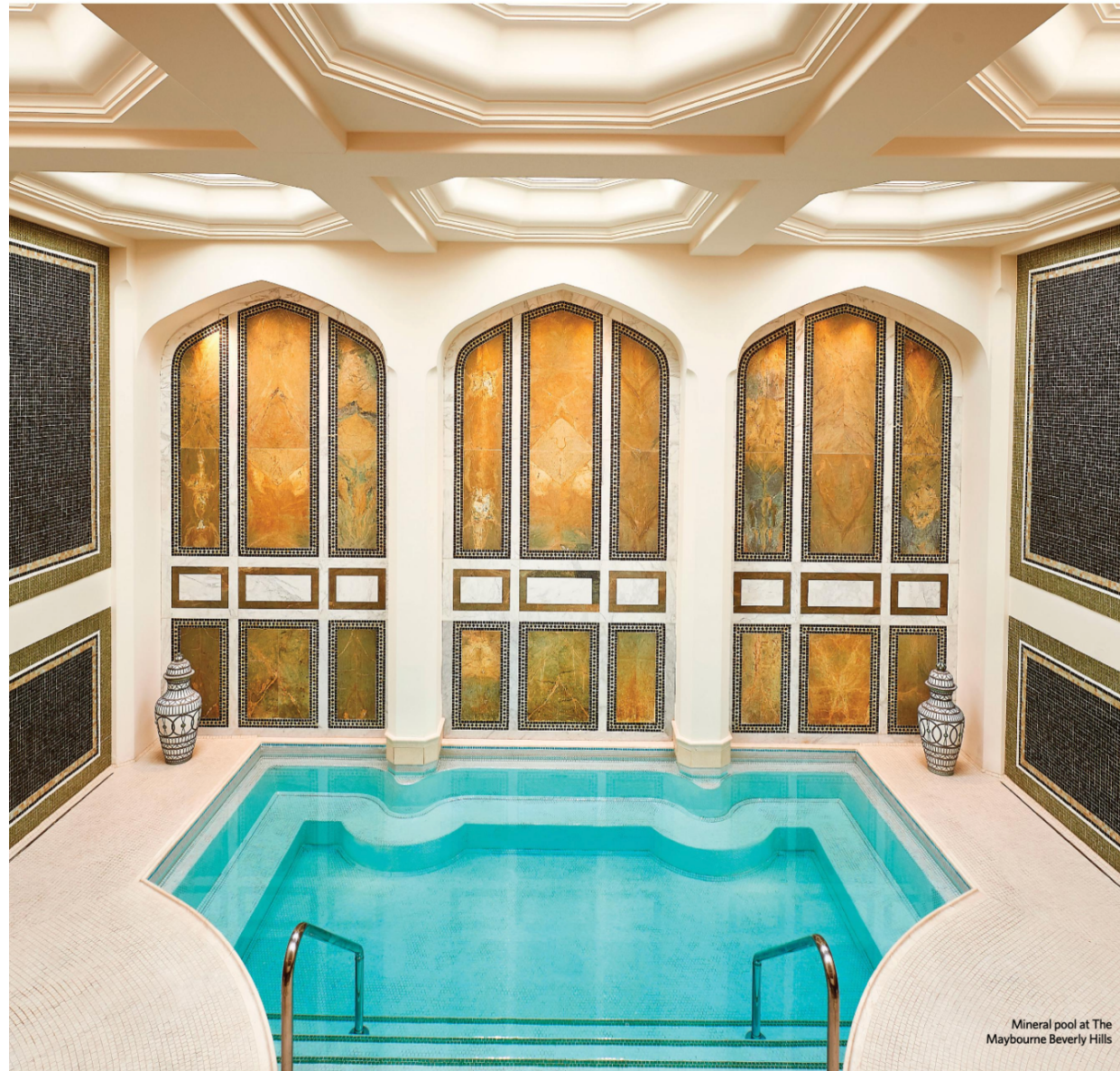
Mineral pool at The Maybourne Beverly Hills